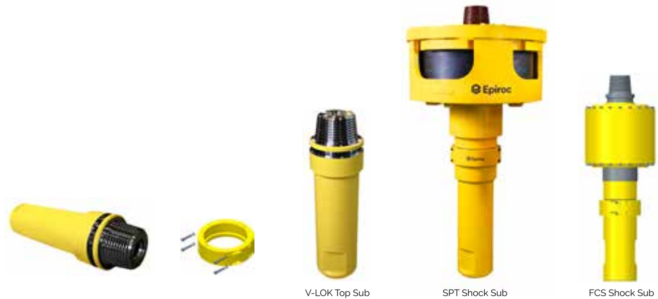
V-LOK Top Sub

V-LOK™ eliminates welding, grinding and the need for a hot permit. No more endless hours waiting for a welder with a permit, no more damage to shock sub housings or top subs from removing weld tabs. Just use V-LOK™.