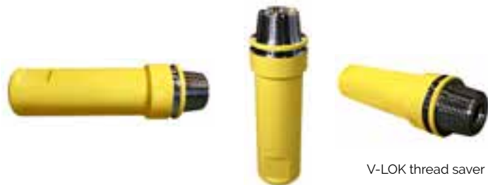
V-LOK thread saver subs